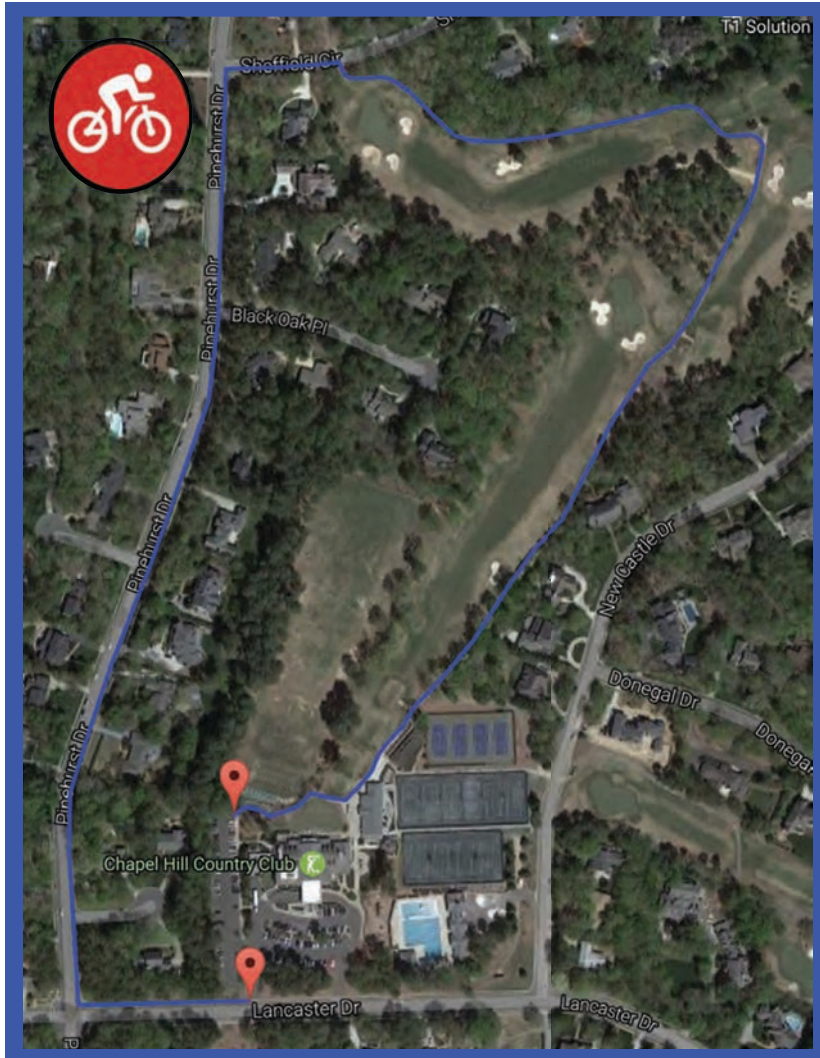
Mini Bike: 1 mile